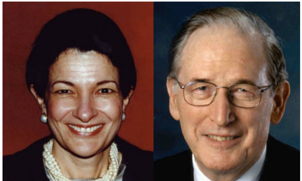
Senators Olympia Snowe (left) and John D. Rockefeller IV (right) use the rhetoric of Holocaust “denial” to attack global warming skeptics.

The letter brought a strong reaction from The Wall Street Journal. Its editorial page observed, “[I]f the Senators are so afraid that a handful of policy wonks at a single small think-tank are in danger of winning this debate, they must not have much confidence in their own case.” Home state newspapers also chided the senators. In West Virginia, The Charleston Daily Mail called the letter “an intemperate attempt to squelch debate,” while in Maine, an editor at The Portland Press Herald wrote that a spokeswoman for Snowe told him that, “[T]he Senator is greatly worried that the average mope on the street can’t figure all this out on his own. So she and her colleague were just trying to clarify the issue,