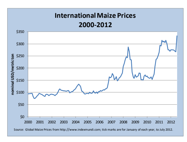
Figure source: Wise, Cost to Mexico of U.S. Corn Ethanol Expansion

This is no small matter. A full 15% of the global corn crop now goes into U.S. ethanol production. <sup>19</sup> It thus seems likely that the RFS has made a non-negligible contribution to the tripling of international maize prices since 2006 and the associated adverse impacts on world hunger.