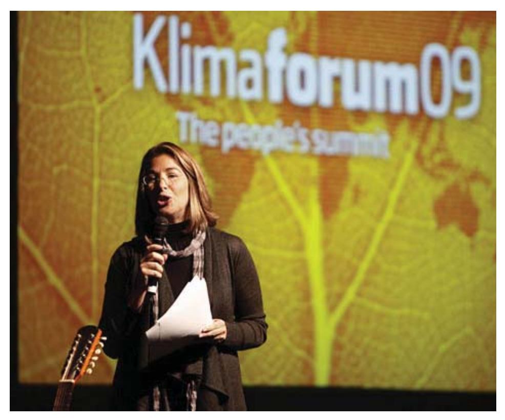
A Red Writer Goes To Bat For The Greens: Canadian communist Naomi Klein denounces capitalism and opposition to draconian emission controls in Copenhagen, Denmark on December 7, 2009.

The pilot's announcement came to my mind four days later when U.N. officials decided to restrict access to the conference—after they had invited from 30,000 to 45,000 official "observers" to participate in it. As a representative of the free-market Competitive Enterprise Institute, I was one of those invited observers. We had logged thousands of miles and spewed tons of carbon dioxide into the atmosphere to get to Denmark only